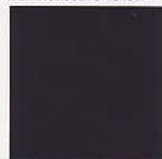
Non Reflective Black

Also available: Reflective White and Yellow