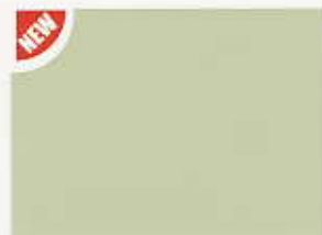
Light Lichen 1069