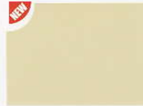
Dry Bamboo 1070