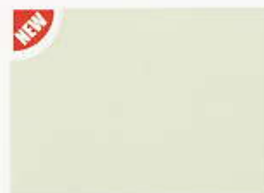
Hidden Green 1071