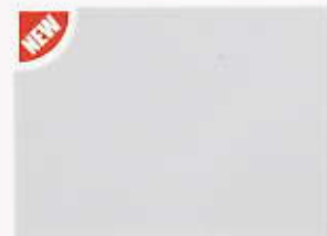
Light Pewter 1067