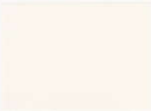
Vanilla White 9190