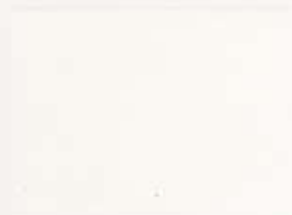
Pinkish White 9116