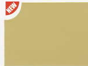
Woven Slats 1068