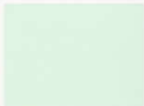
Garden Fragrance 0225